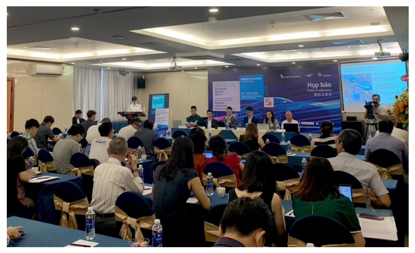
Pre-show press conference for Automechanika Ho Chi Minh City 2023

At the halfway mark, Vietnam's automotive industry is on track to achieve 25 percent compound annual growth (between 2020 and 2025)¹. The rise is owed to the domestic economy bolstering demand and supportive tax incentives on production, import tariffs for vehicles, and investment on infrastructure. To support this upward trajectory, Automechanika Ho Chi Minh City is set to return with over 450 exhibitors, surpassing previous figures at what will be the celebratory fifth edition. From 23 to 25 June 2023 at the Saigon Exhibition and Convention Center (SECC), the show will house the latest products, services and technologies, as well as feature an impressive line-up of events for a one-of-a-kind industry gathering.